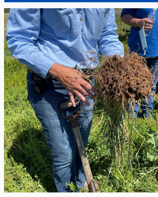
Cuppa Chat Day October 2021